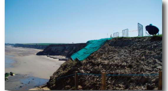
Happisburgh works - netting has been put up to prevent a protected species nesting in the cliffs

Marine Licence applications have been submitted for generic 10 year maintenance works that fall outside existing exempt activities. Likewise a 10 year planning application has also be submitted for Happisburgh to continue recutting of the ramp and roll back of the rock sill.