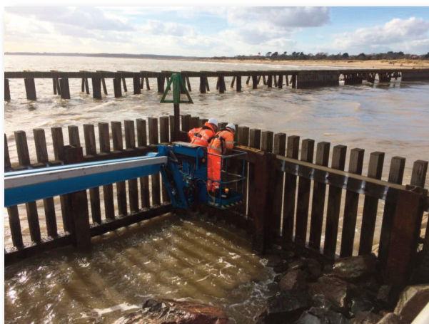
The Water Management Alliance inspecting and repairing Southwold fender