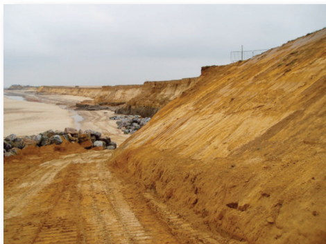
Happisburgh access ramp

A lot of work has gone into re-cutting the access ramp at Happisburgh after continual failure due to the toe of the ramp being washed away. The consents were granted to realign the rock sill closer to the cliff to enable it to provide the protection it was designed to. This rock sill realignment was completed in early March and the re-cutting of the access ramp began later in the month. Conditions permitting we are hoping to have the access ramp open by mid April.