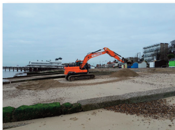
Works being carried out at Felixstowe