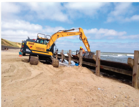
Repairs to revetments at Ostend and Bacton