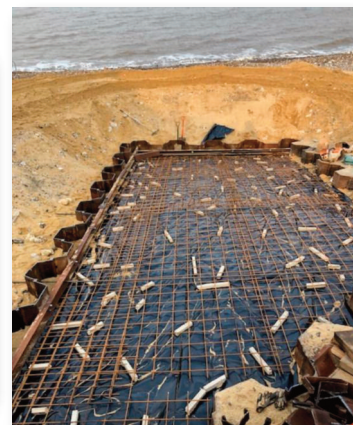
Extension of the access ramp at East Runton