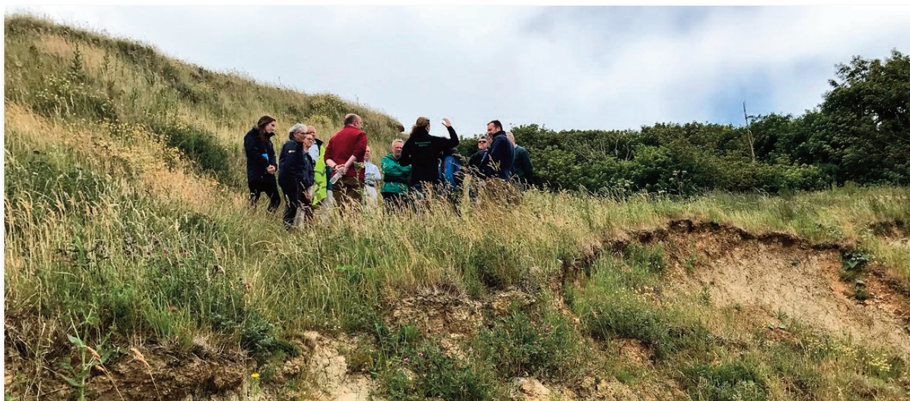
Last summer's North Norfolk Coastal Forum field trip to Trimmingham Cliffs